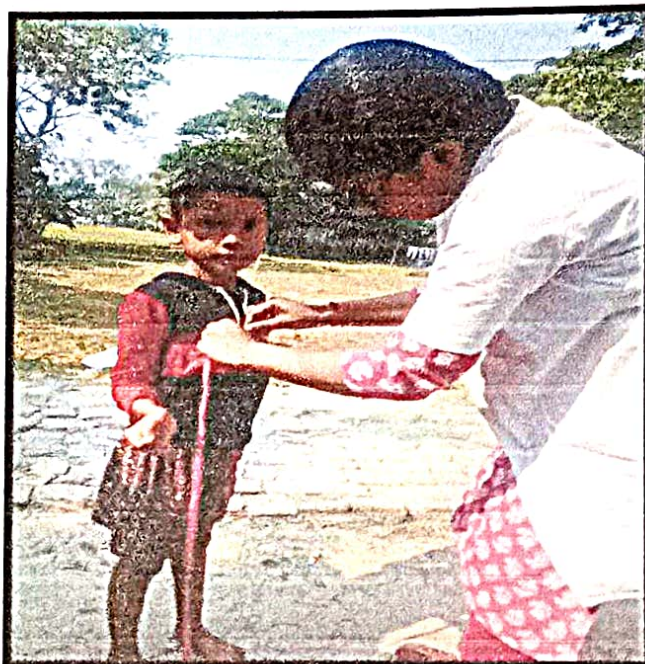
Plate 3: Different activities during survey of slum SAM pre-school children of Bhagwanpur-II Block area